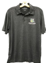
Golf shirts $40 (S, M, L, XL, XXL)