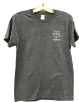
T-shirt $20 (S, M, L, XL, XXL)