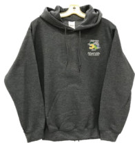
Hoodie $45 (S, M, L, XL, XXL)