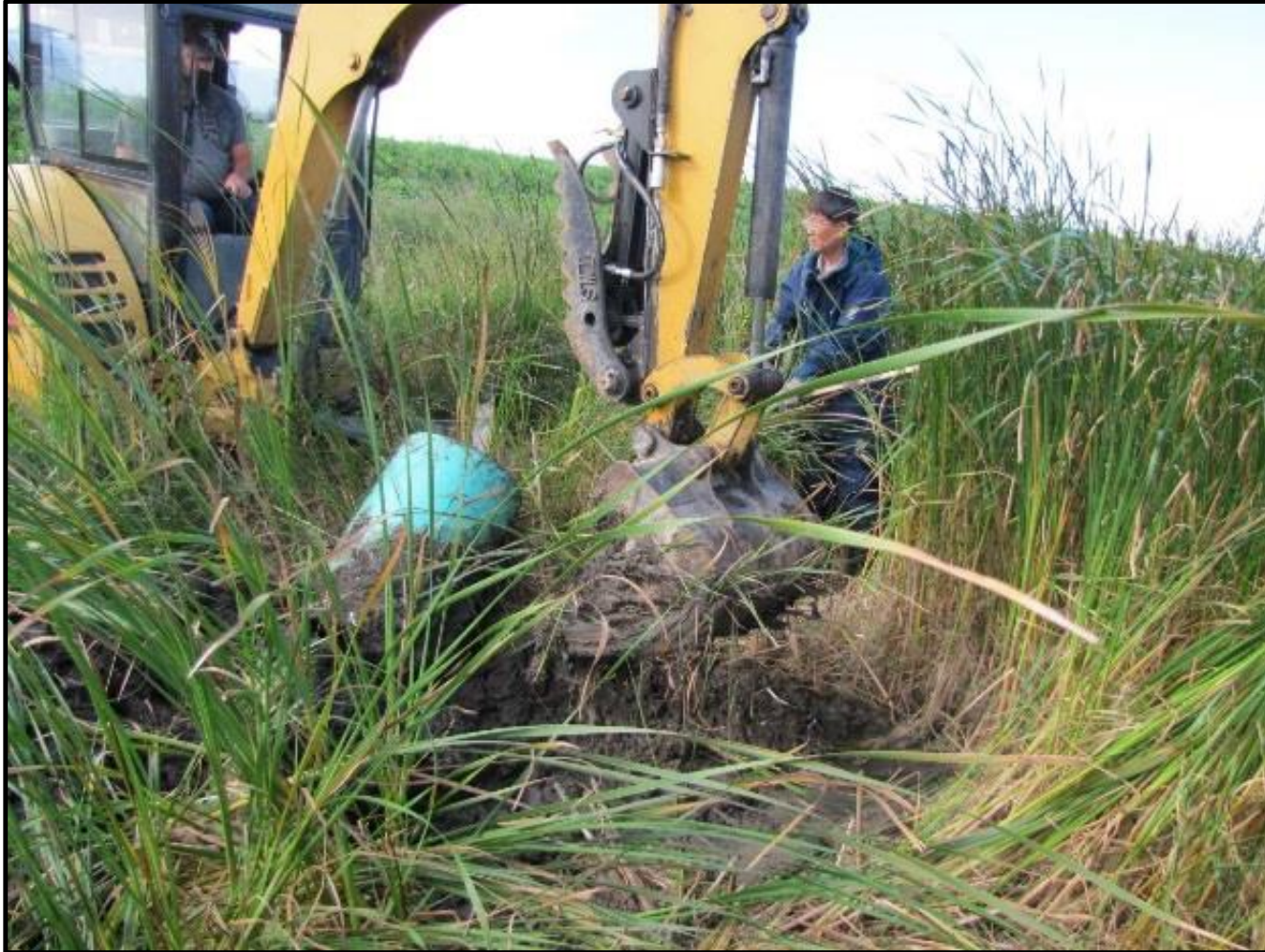
Figure 1. Project Partners (the Town of Niverville and the University of Manitoba) work together to install experimental units for the flooding experiment. Summer 2015.