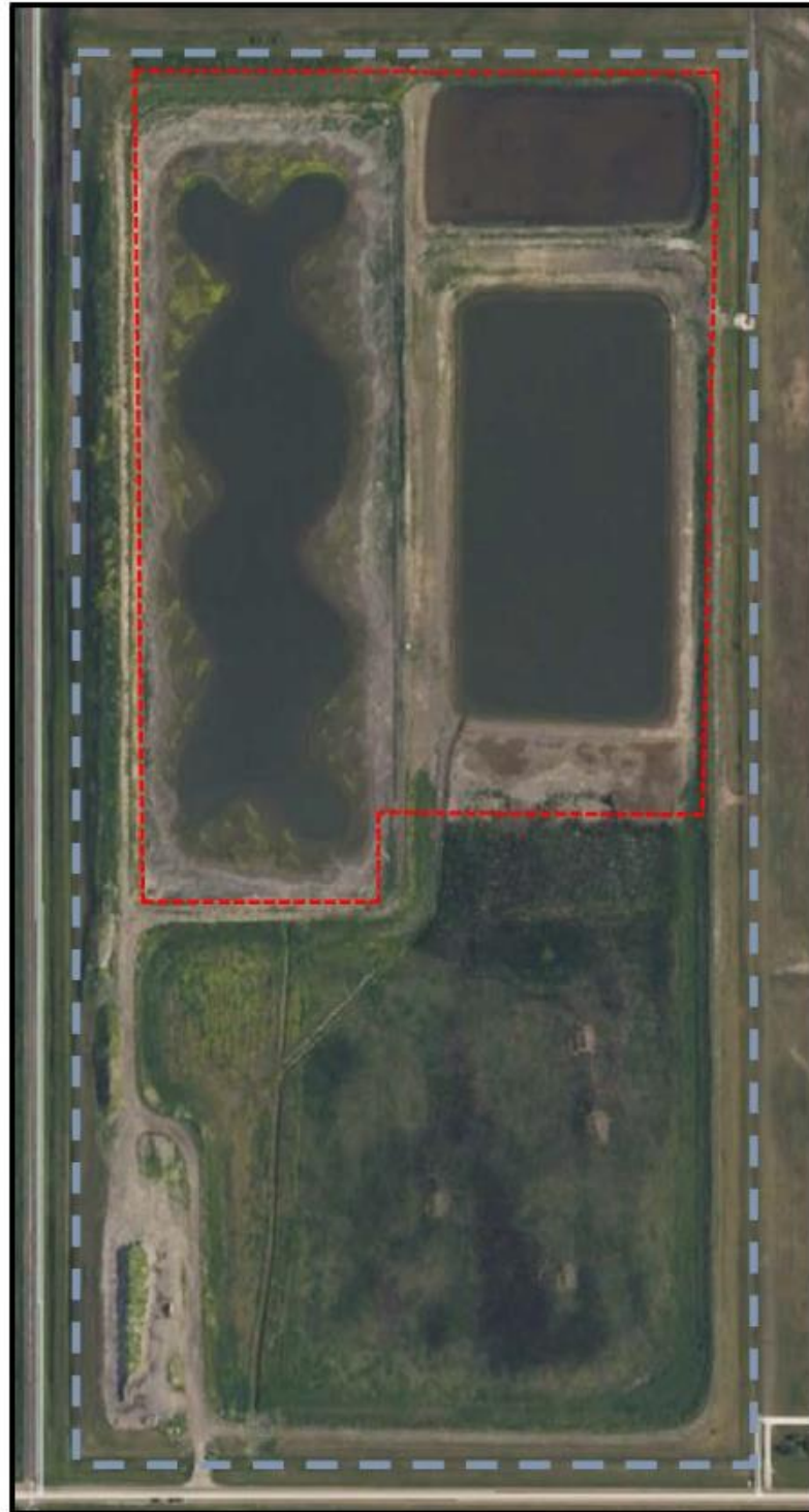
Figure 5. Proposed 1.2 m fencing location around perimeter of old lagoon site (light-blue, dashed line) and proposed 1.8 m fencing on the inside of the lagoon berms around areas remaining under licence (i.e., control, holding, and wetland cells). Note that the fencing locations shown are approximate and for discussion purposes only. Image courtesy of Google Earth (Imagery date: 2013).